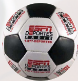
SBS-5 Official 8.5"