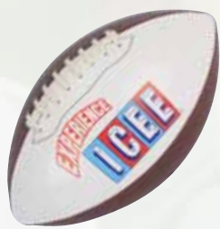
FBS-9 Official 11"