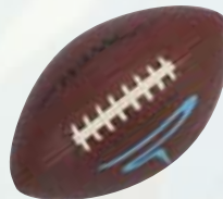
FBS-3 Mini 8.5"