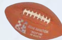
FBR-9 Official 11"