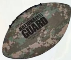
FBS-9 Official 11"