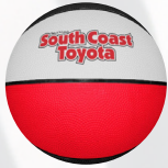
BBR-7 Official 9.5"