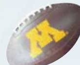
FBS-1 Micro 6"