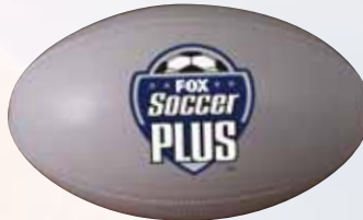
RB-9 11.5" Official