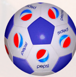
SBS-5 Promo 8.5"