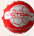
SBS-4 Junior 7.5"