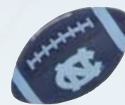
FBR-1 Micro 6"