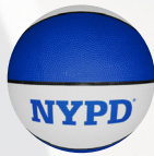
BBR-6 Inter 9"