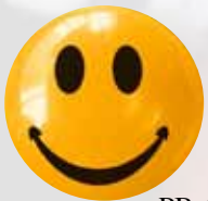
PB-6 Small 6"