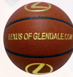
BBS-7 Official 9.5"