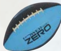
FBR-3 Mini 8.5"